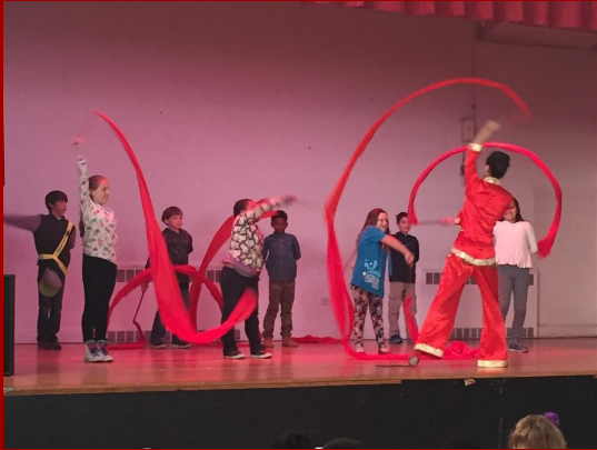
Dance China New York visits MHES