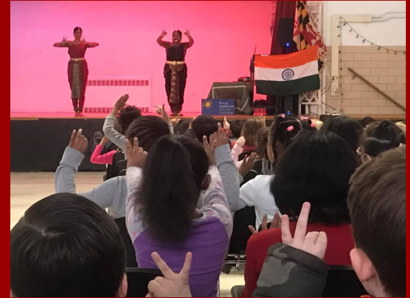
Sounds of India teaching our kids traditional Indian music and dance