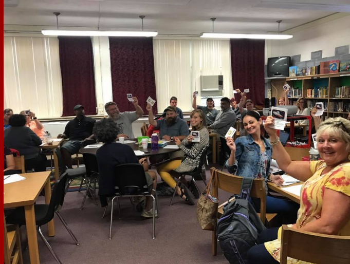
Teachers receive Target gift cards from the PTO